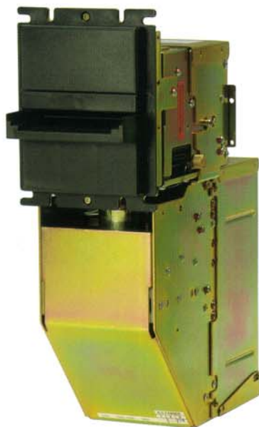
GBA Compact Vertical Downstacker