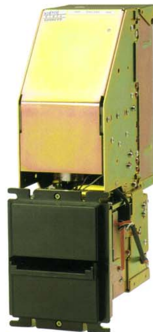
GBA Compact Vertical Upstacker