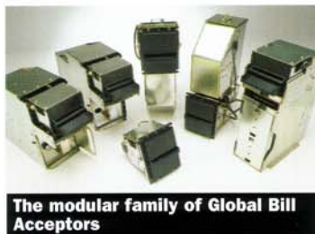
The modular family of Global Bill Acceptors

The Global Bill Acceptor range of stackers can be fitted with either the GBA or the GBA II Validator. The stacker options include the WGBA Vertical Gaming Unit, GBA Vertical Upstacker, GBA Vertical Downstacker, GBA Compact Vertical Upstacker, GBA Compact Vertical Downstacker, GBA Horizontal Vault, GBA Horizontal Downstacker and GBA Vertical Vault.