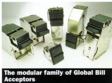
The modular family of Global Bill Acceptors

The Global Bill Acceptor range of stackers can be fitted with either the GBA or the GBA II Validator. The stacker options include the WGBA Vertical Gaming Unit, GBA Vertical Upstacker, GBA Vertical Downstacker, GBA Compact Vertical Upstacker, GBA Compact Vertical Downstacker, GBA Horizontal Vault, GBA Horizontal Downstacker and GBA Vertical Vault.